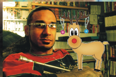
BROWNMAN - trumpet