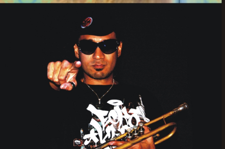
BROWNMAN - trumpet