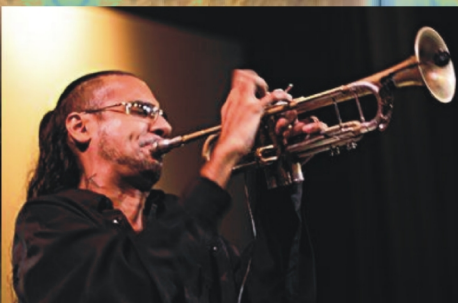
BROWNMAN - trumpet