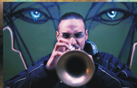
BROWNMAN - trumpet