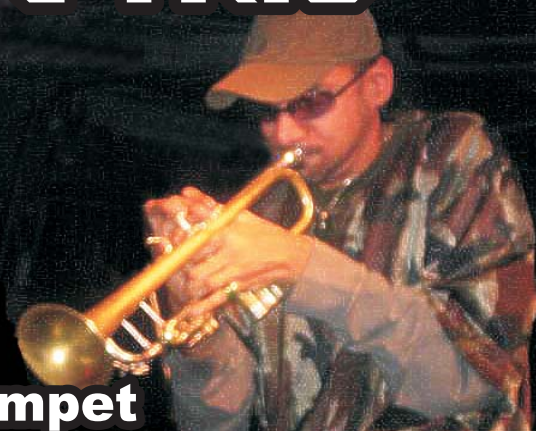
BROWNMAN - trumpet

"Canada's preeminent jazz trumpet player" - New York Village Voice Magazine