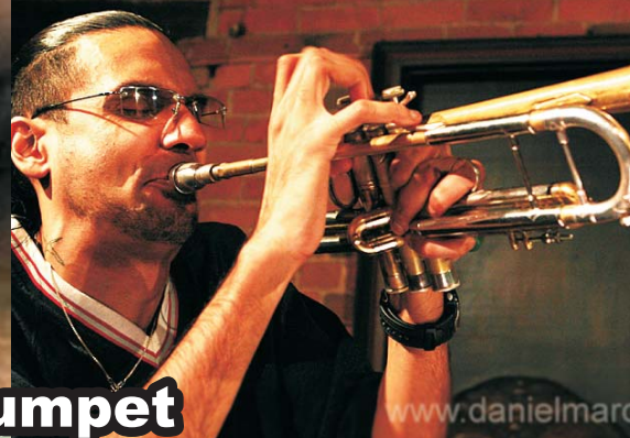
BROWNMAN - trumpet

"Canada's preeminent jazz trumpet player" - New York Village Voice Magazine