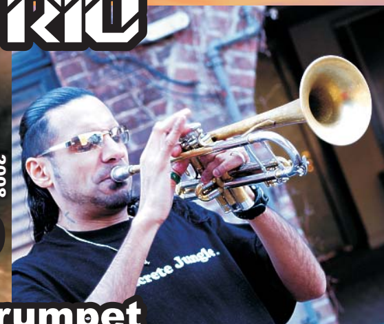
BROWNMAN - trumpet

"Canada's preeminent jazz trumpet player" - New York Village Voice Magazine